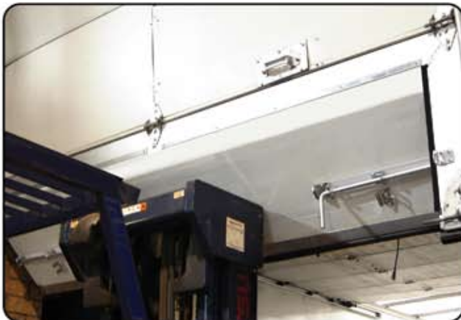
ABLE TO WITHSTAND IMPACT FROM A FORKLIFTS MAST.