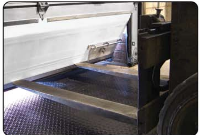
RESISTS SPEARING BY FORKLIFTS OR IMPACT BY PRODUCT.